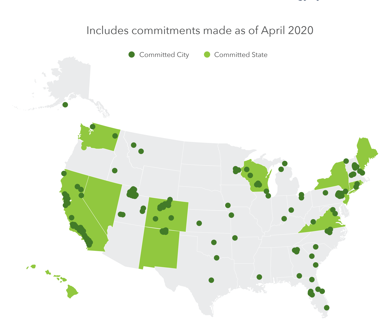
Exhibit 3 States and Cities with Commitment to 100% Clean Energy by 2050*

*Map illustrates states with 100% clean or renewable energy commitments and cities with 100% renewable electricity commitments.